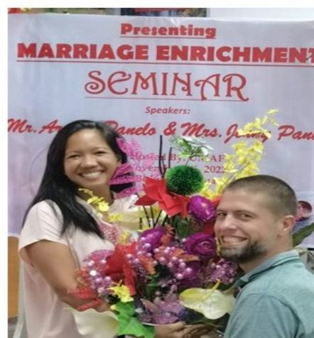
Still in love! (Our house church's marriage seminar)