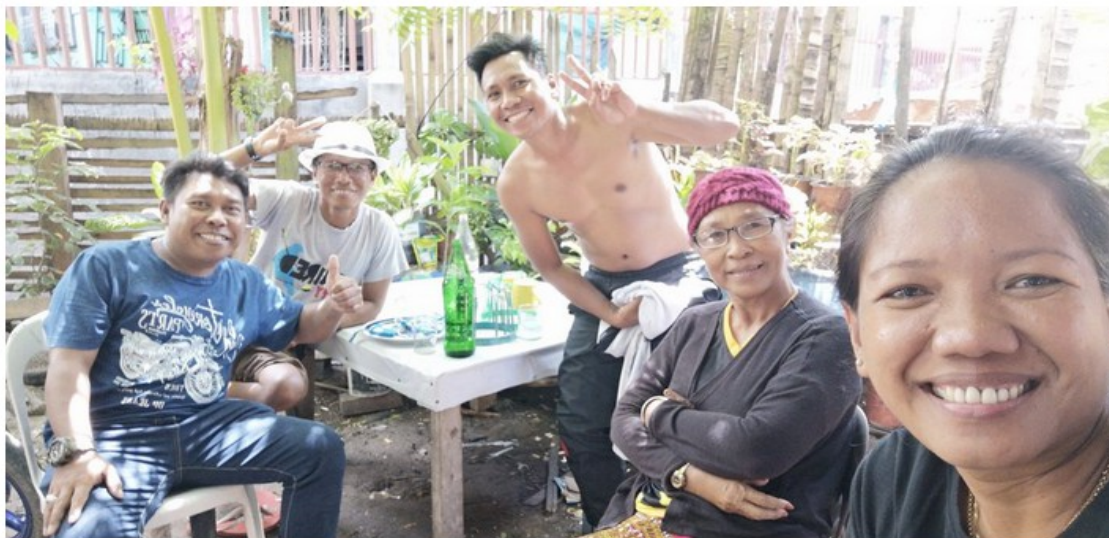
Still involved in community!