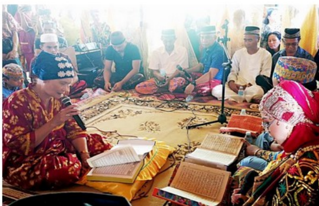
Still researching M.A. thesis!