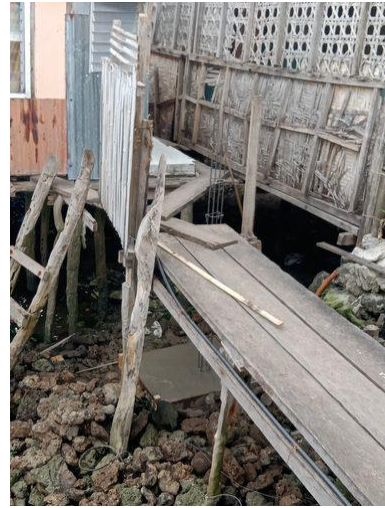
Current bridge. Stilt below.