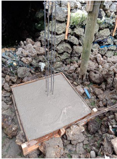
Poured at low tide.