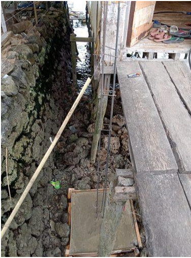
Base of a cement stilt.

Pray for wisdom and skill for our workers.