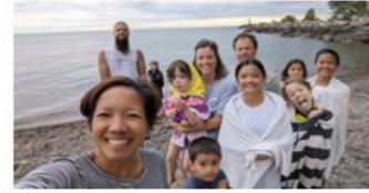
Visiting with a Canadian midwife friend and her family.

It was a dream to get to visit Niagara Falls. We did it on our way to Pennsylvania.