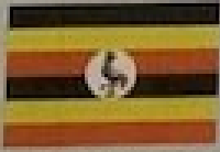
Uganda's National Flag