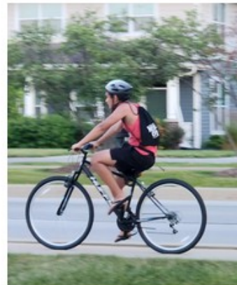
He can bike to work but has missed several of our trips.