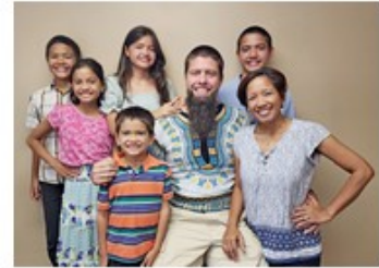
Family pic when we were all together prior to travels.