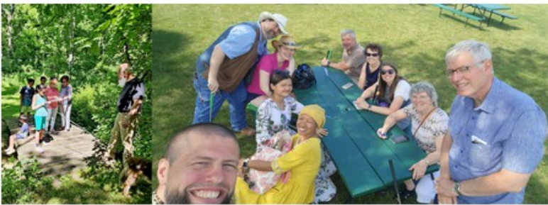
Exploring the woods with our hosts. After lunch activity with other York friends.