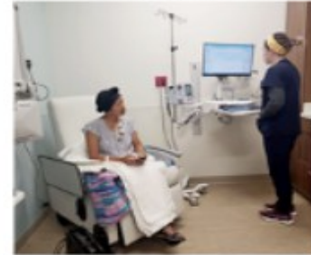
Second chemo treatment.