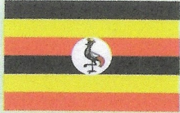
Uganda's National Flag